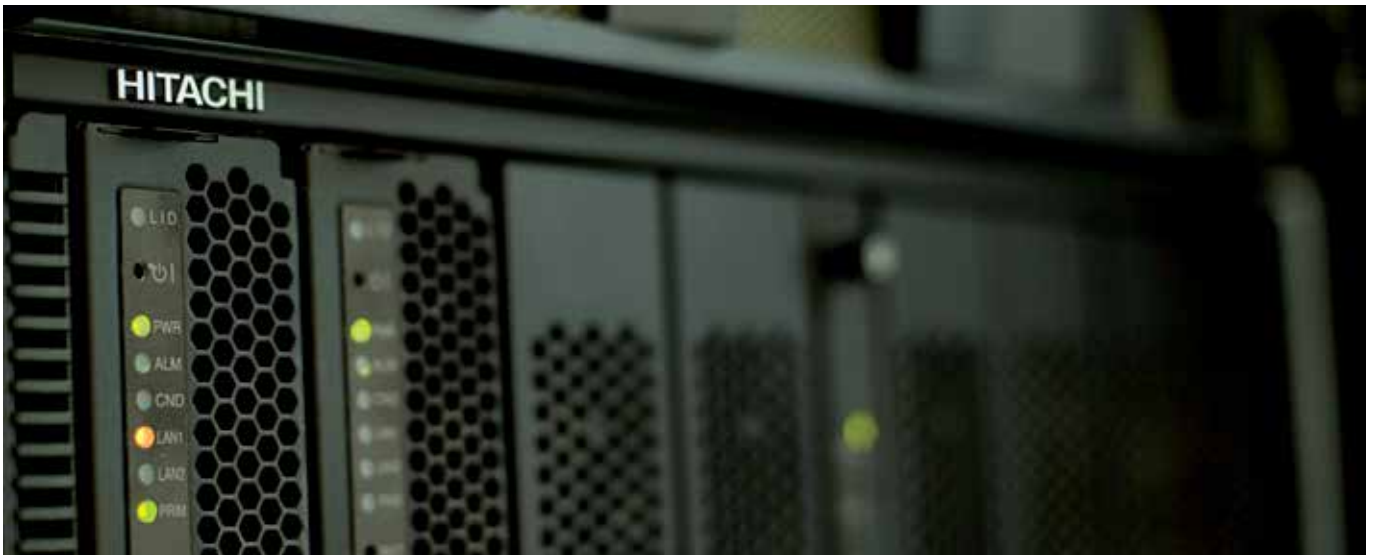
When SAP Hana is what is needed, Hitachi Data Systems (HDS) is the first choice, both on-premise (see E-3 cover story, June 2014) and on-demand.

that business processes are kept in operation on a lasting basis, by means of a reserve node or a system takeover of the Hana enquiries. Hitachi UCP Select offers a high level of availability by means of Hitachi Blade Servers and also through mirroring of the storage devices, enabling companies to rely on their operation-critical environments without unwanted gaps in operations. Storage devices with long operational life play a key role in protecting the Hana data. Therefore a disaster-tolerance solution needs to support the Hana storage-device copies: these correspond to the Enterprise-class requirements (with RPO-related and RTO-related stipulations) and are set up to deal with long-term 24/7 operation of business-critical environments. The advantage that Hitachi's disaster tolerance has is in the use of the Hitachi Virtual Storage Platform (VSP) as a long-term storage device for Hana. The VSP works with the Hitachi TrueCopy Synchronous Storage Replication Software, in order to attain the necessary disaster tolerance for Hana.